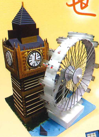
1D 謝政橋 (獲全港優異獎)