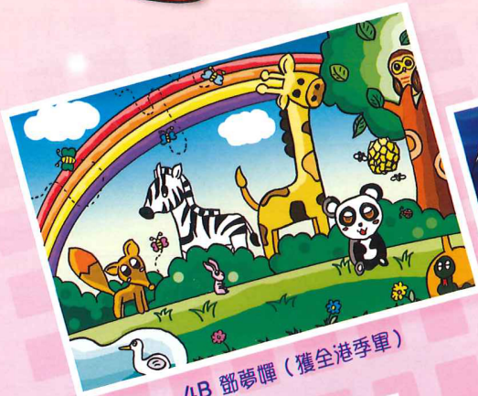
4B 鄧夢暉 (獲全港季軍)